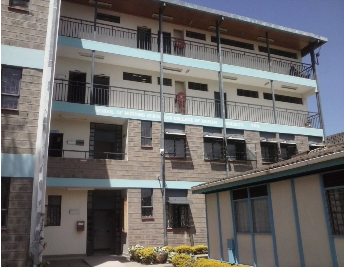
School of Nursing Sciences, College of health Sciences located at the Kenyatta National Hospital Campus